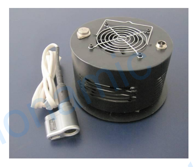
10W generator comes with the wire for the outputs: 12 VDC car lighter adapter, 5 VDC USB

Put the generator on top of any stove to generate free electricity